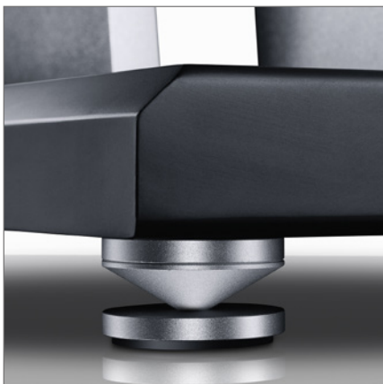
■ Height-adjustable solid metal spikes with floor-friendly, damped solid metal pads