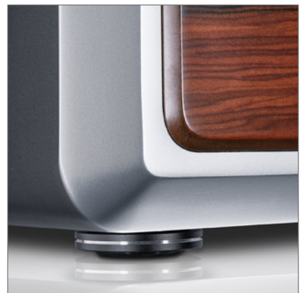
■ A secure stand as a compact loudspeaker even without a stand thanks to the unit feet included in the scope of delivery