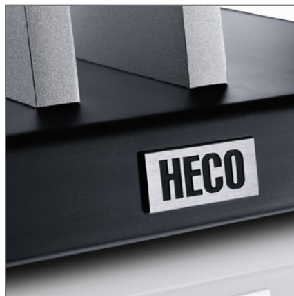
■ Heavy and low-resonance construction with four sturdy aluminum struts and 36 mm thick MDF base plate